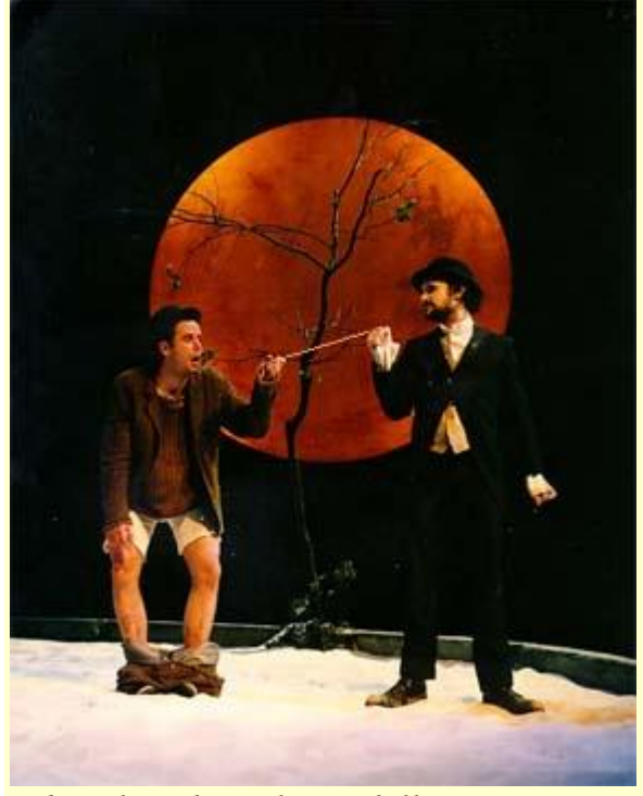
It breaks. They almost fall.